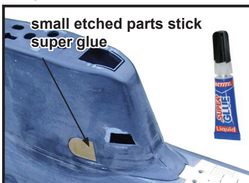
small etched parts stick super glue