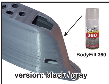
version: black/ gray